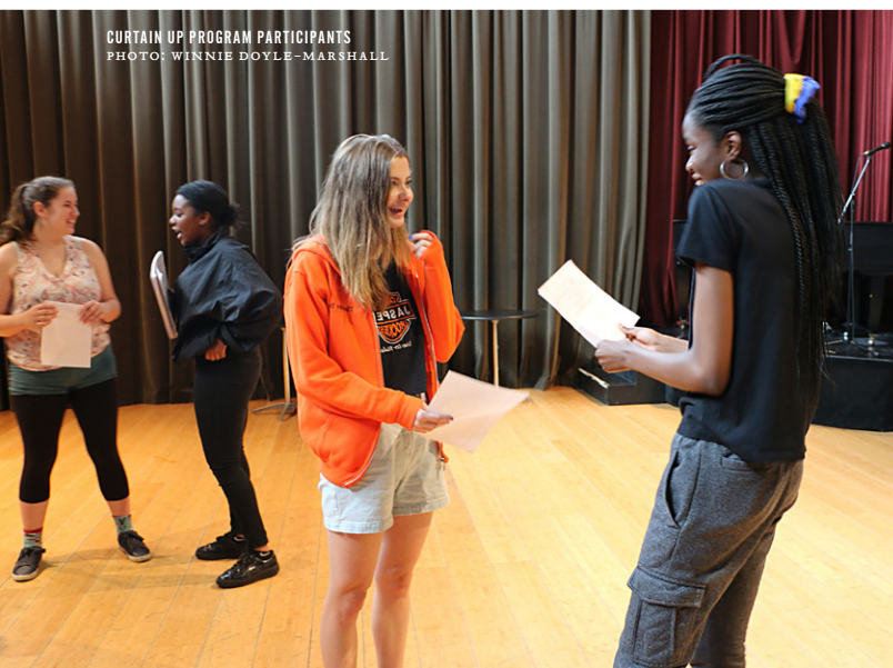
CURTAIN UP PROGRAM PARTICIPANTS